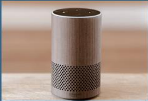
Digital Voice Consultant