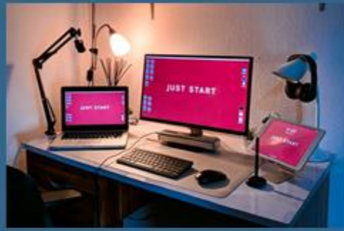
Smart Home Devices