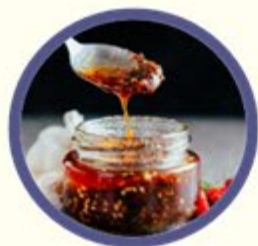
• sweet chili sauce