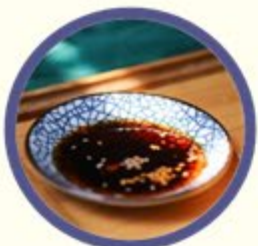
• chili soy sauce