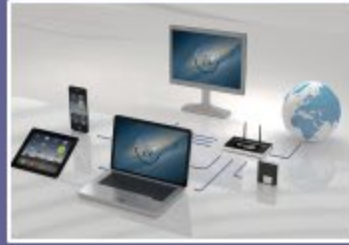
Computers and Internet