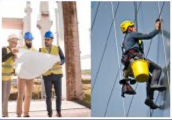
Jobs and Occupations