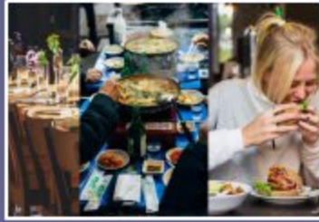
Restaurants and Eating Out