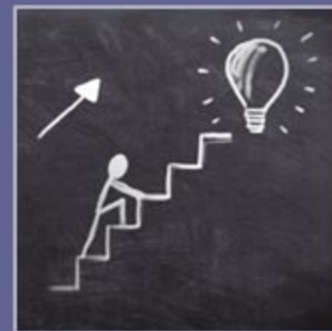
Dreams and Goals