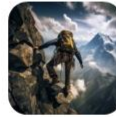
go mountain climbing