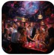
have a nightlife