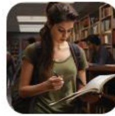
go to the library