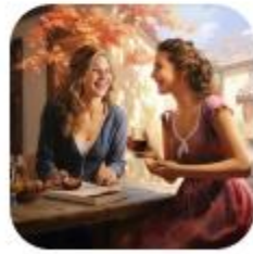
hang out with a friend