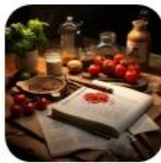
try a new recipe