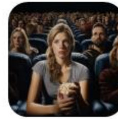
go to the cinema