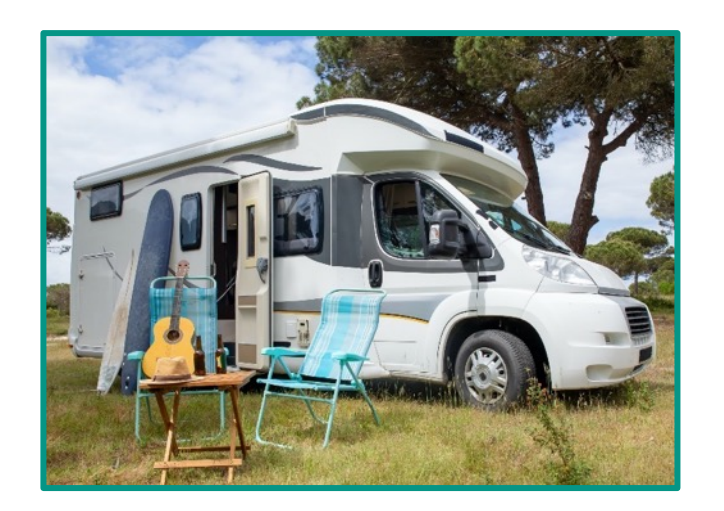
living in an RV (Recreational Vehicle)

Do you like living in an RV? Everyone has their own answer. I think living in a normal