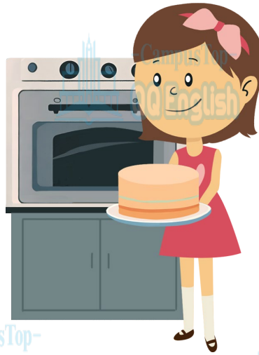
bake a cake