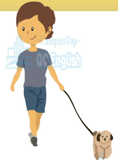
walk the dog