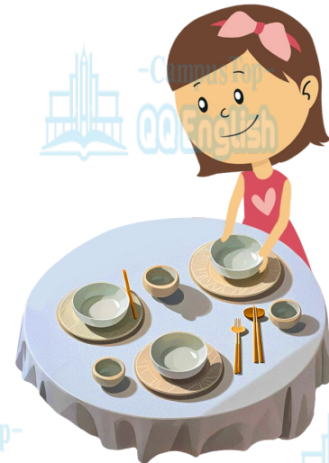
set the table