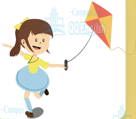
fly a kite