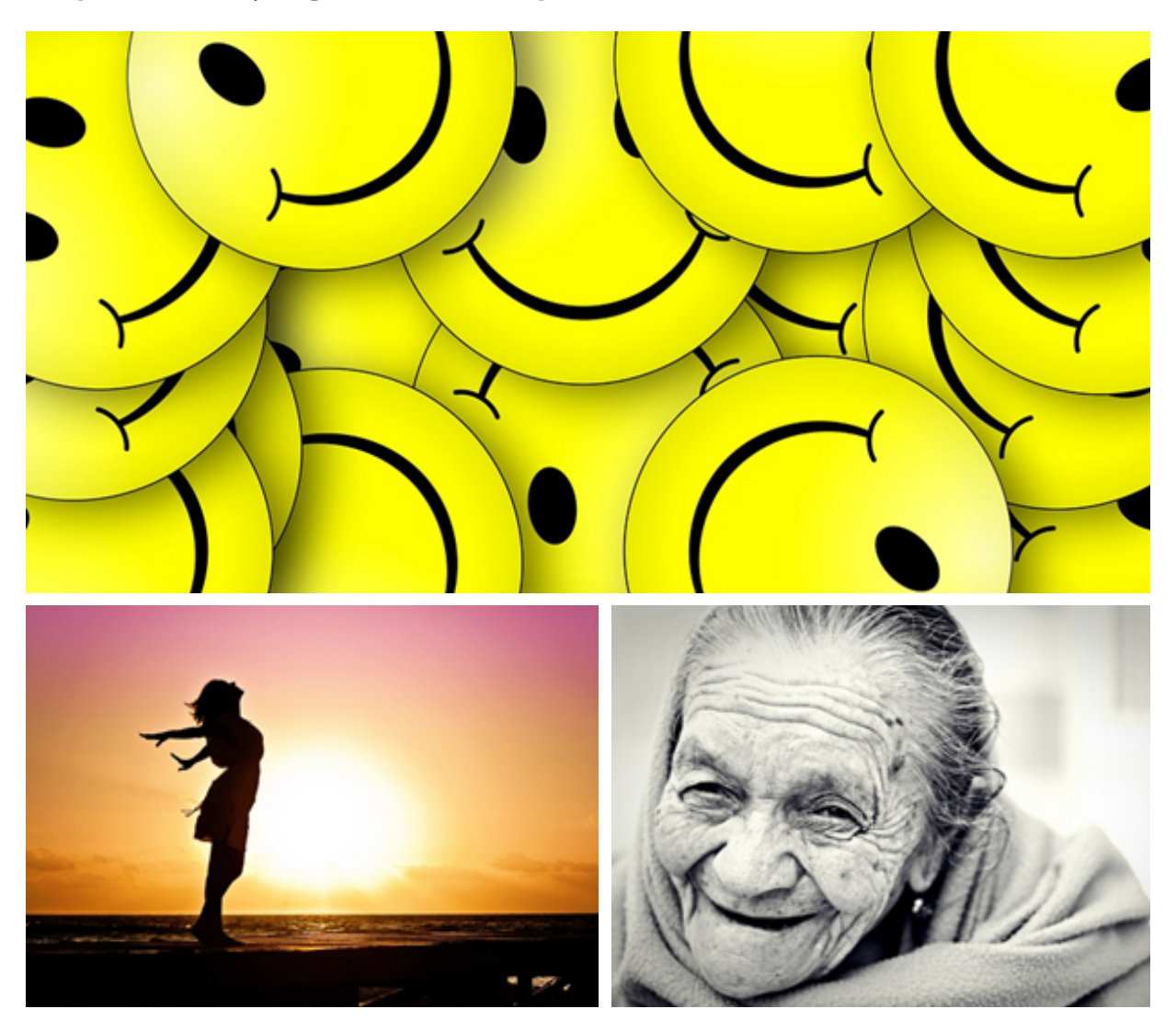
Look at the pictures. Can you guess what the topic idiom is about?