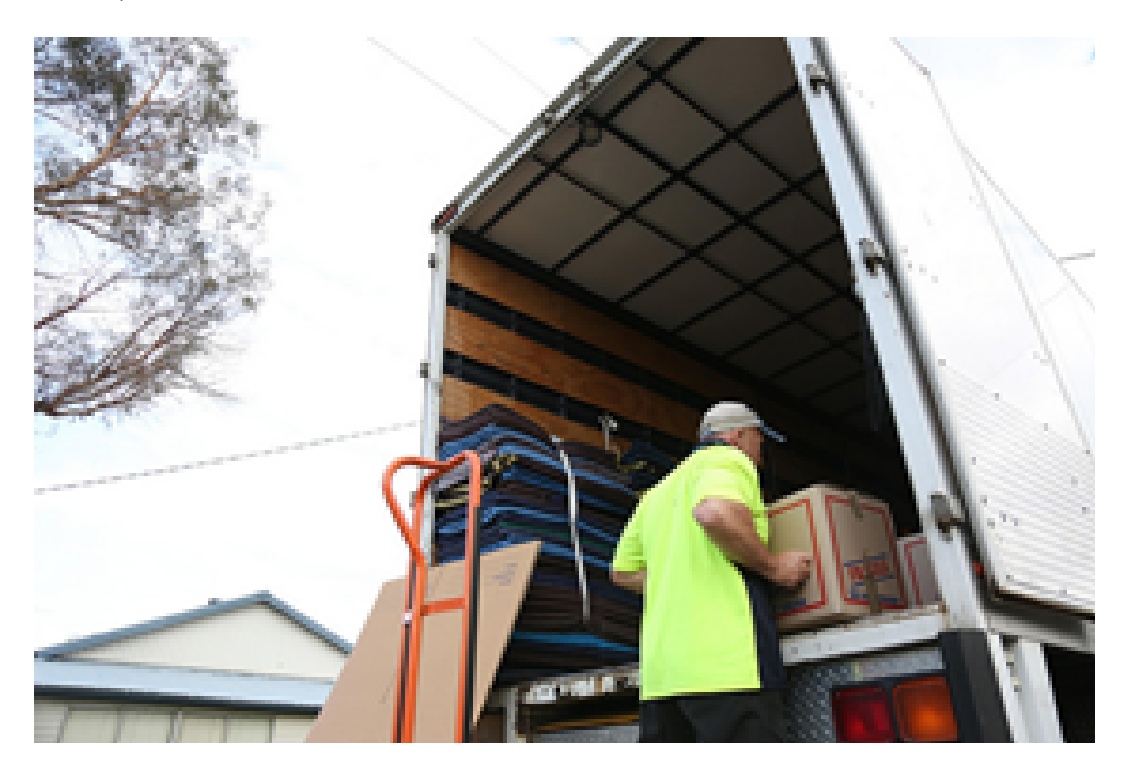
By Sunset Removals: A mover loading the removal truck with boxes photo