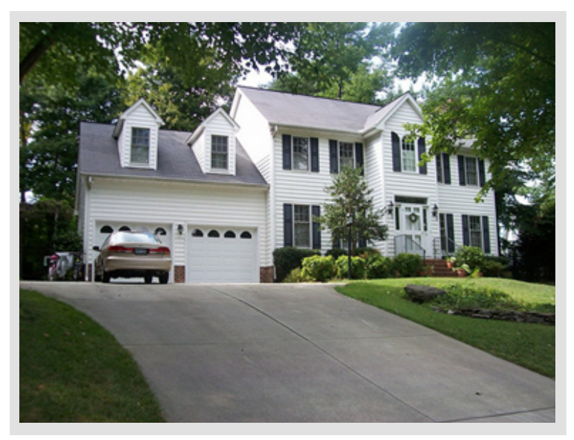
Driveway