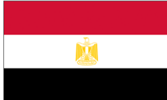
Egypt Don't eat anything with your left hand.